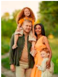
Meet Your Neighbors