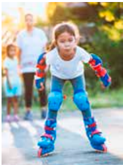
Athletes, Artists & Hobbyists